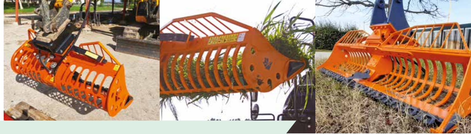
Images are for illustrative purposes only and refer to the previous model.