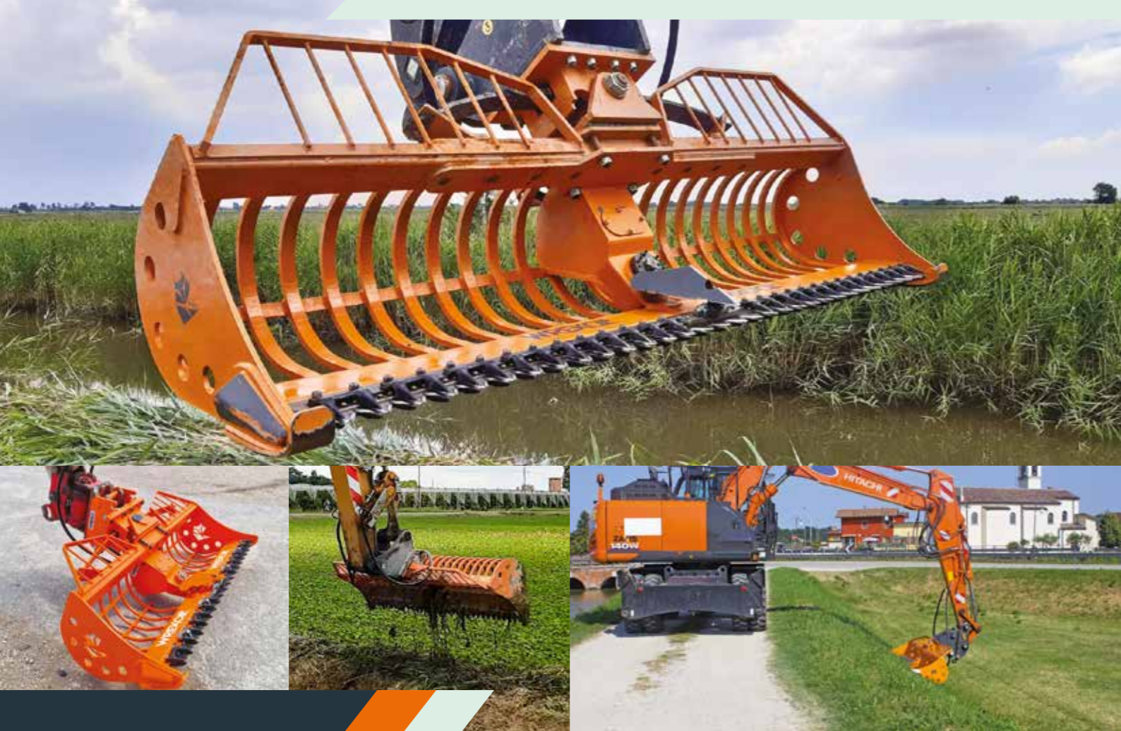
Images are for illustrative purposes only and refer to the previous model.

The WMB Series Mowing Bucket is a specialized attachment for the agricultural, forestry, and land maintenance sectors . Designed for land reclamation consortia, agricultural businesses, and forestry contractors, it is ideal for cutting grass, shrubs, reeds, and light vegetation along embankments, ditches, uncultivated land, and roadsides —ensuring fast and precise operations even in hard-to-reach areas. It is particularly suitable for maintaining proper irrigation water flow, helping keep channels and waterways consistently efficient.