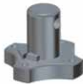
MECHANICAL ROTOR FOR MECHANICAL ROTATION